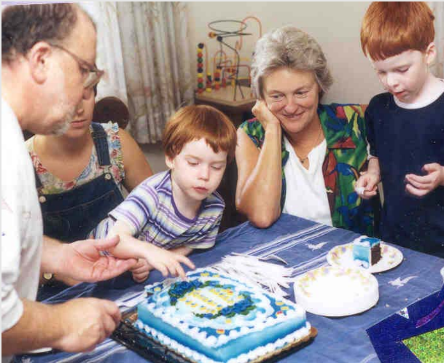
Birth to 3 graduate from Dane county celebrates 6th birthday