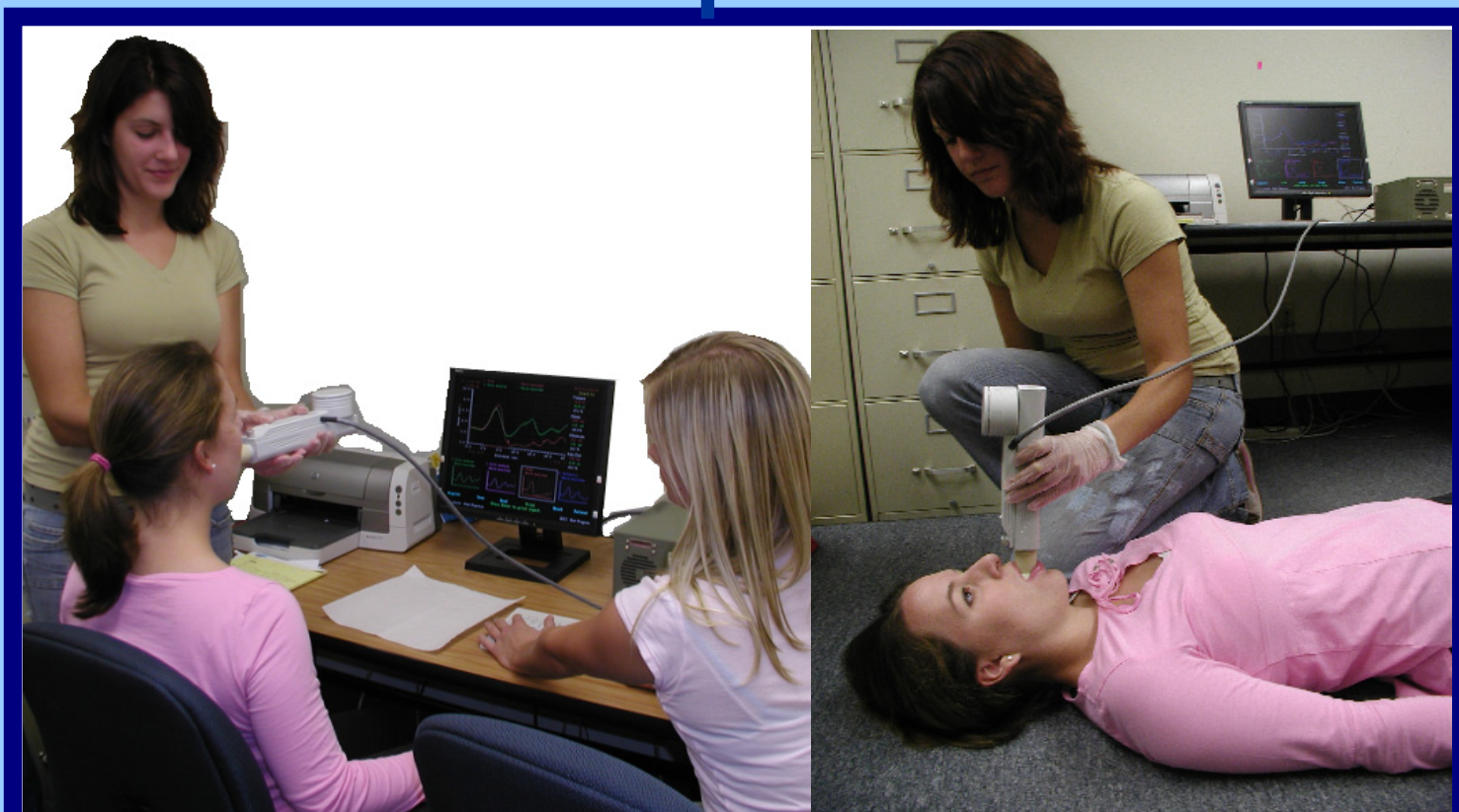
Figure 1. Participants exhale into wavelube with mouthpiece for ~3 seconds in upright and supine body positions. A fraction of the acoustic wave is reflected back at each point of discontinuity in the upper airway and recorded by a microphone on the wavelube. Computer processing of the reflected sound signals provides an area distance curve representing the lumen together with cross-sectional area and volume - See figure 2.

Volumetric 3D measurements of the pharyngeal cavity (OPJ to glottis) were made from the 3D model of the pharyngeal region using the software Analyze (by AnalyzeDirect), as well as from the sum of area of axial 2D slices using SigmaScan.